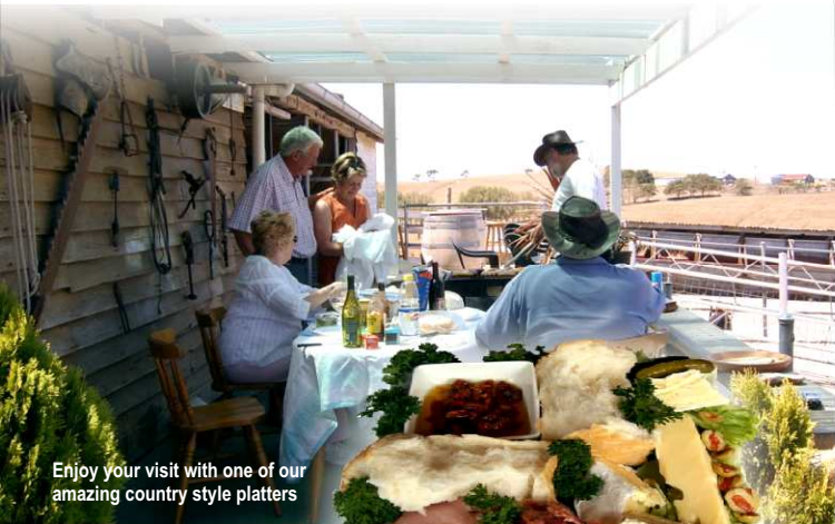
Enjoy your visit with one of our amazing country style platters